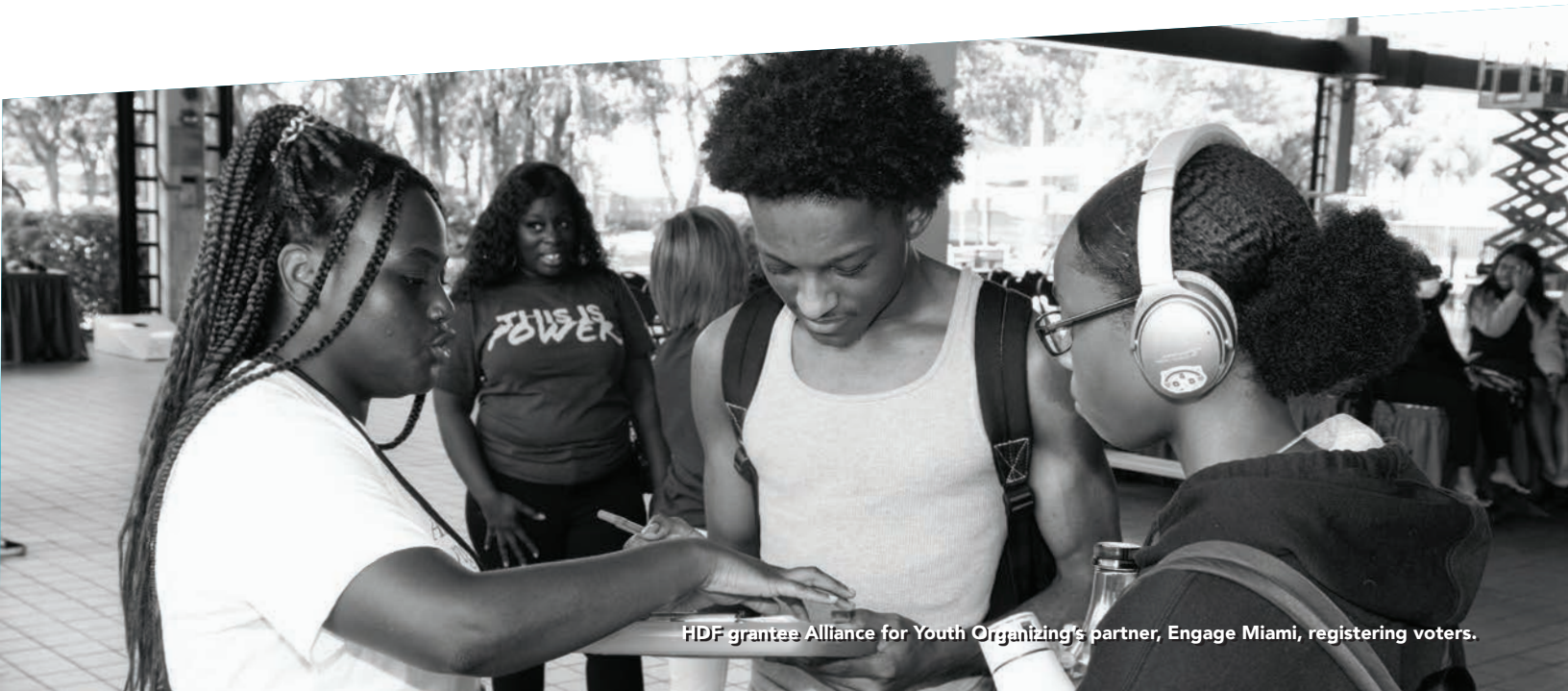
HDF grantee Alliance for Youth Organizing's partner, Engage Miami, registering voters.

By 2028, Millennials and Gen Z will make up a majority of the eligible voters , and HDF is prioritizing investment in the structures and narratives to ensure that young voters meet their potential. Statewide high school and campus organizing efforts at organizations like Leaders Igniting Transformation, JOLT Texas, and the Ohio Student Association develop nimble movement leaders year-round while activating voters on- and offline. Meanwhile, national organizations such as the Alliance for Youth Organizing provide training on advocacy and technical assistance on finance and operational support to these state and local organizations. Organizations such as NextGen America have built networks of social media influencers to share salient information with a large audience of Gen Z voters. Sustaining this elevated youth turnout since 2018 requires a healthy ecosystem of youth organizations capable of developing leaders and activating new voters in person and online.