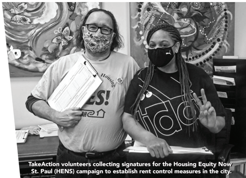
TakeAction volunteers collecting signatures for the Housing Equity Now St. Paul (HENS) campaign to establish rent control measures in the city.

In 2023, HDF is prioritizing voting rights advocacy at the state level. The 2022 midterm elections created new opportunities and challenges for voting rights advocates. Pro-voting rights majorities in Michigan and Minnesota provide opportunities for policy change. The Michigan legislature is considering passage of a bill that would expand voting rights for people with disabilities and people whose primary language is not English while protecting voters from intimidation at the polls. The State of Minnesota passed a law restoring voting rights for more than 55,000 formerly incarcerated people , starting on July 1, and legislators are considering a campaign finance law that would challenge foreign-influenced corporations from interfering in elections. Meanwhile, voting rights advocates in Nevada are defending their victories from previous legislative sessions, under a newly divided government.