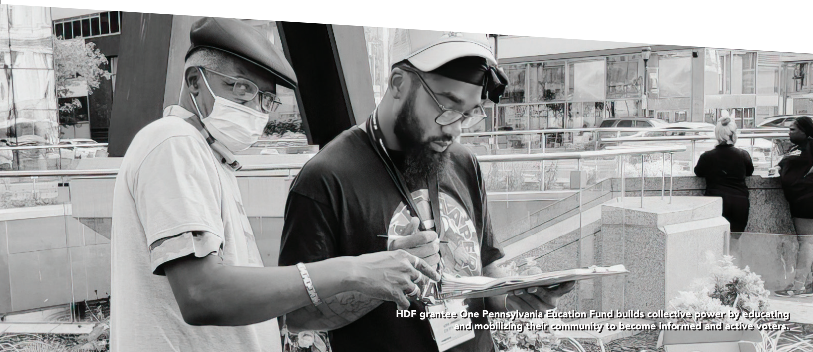
HDF grantee One Pennsylvania Education Fund builds collective power by educating and mobilizing their community to become informed and active voters.

People historically denied power at every level of government need a say at the local level. Yet, the turnout gap between white and BIPOC (Black, Indigenous, and people of color) voters is exacerbated in state and local elections, compared with presidential and midterm elections. Most low-dollar down-ballot campaigns target the rare super voters who have voted in three or more local or primary elections. Unsurprisingly, these super voters skew older, wealthier, and whiter and are more likely to own homes, causing public policy to favor these voters.