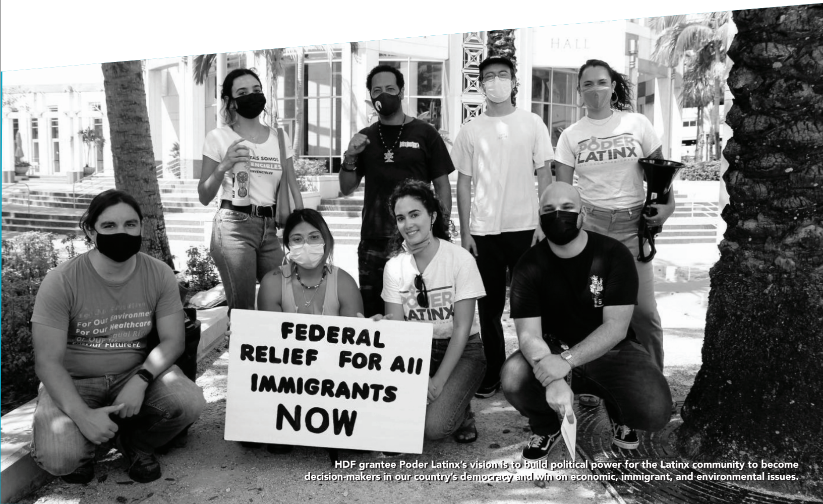
HDF grantee Poder Latinx's vision is to build political power for the Latinx community to become decision-makers in our country's democracy and win on economic, immigrant, and environmental issues.

To expand the electorate in 2024 and empower new Americans, HDF will prioritize grantmaking to organizations rooted in immigrant communities that connect English to speakers of other languages and citizenship classes with voter registration, education, and engagement. Many immigrants come to the US from countries with vastly different political systems. Trusted organizations educate new Americans on how to register and cast a ballot while including information on who and what is on the ballot.